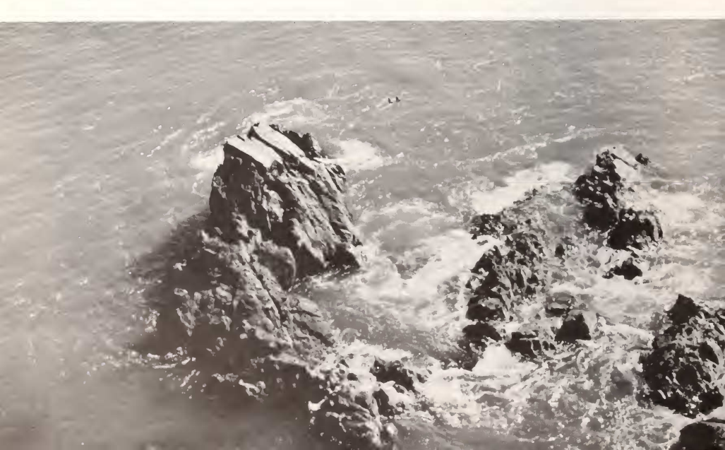
Fig. 13. Rocks adjacent to cliffs typically used by loafing harlequins while flightless; Cape Peirce, 21 August 1973.